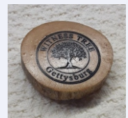
WITNESS TREE MAGNET

Magnets, Ear Rings, Buttons and Lapel Pins made from the American Sycamore Tree just across the Street from the Shop.